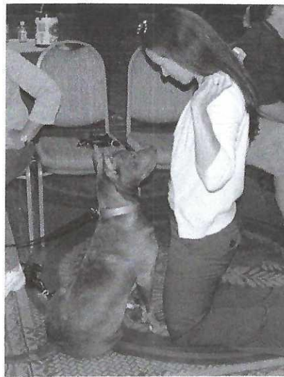
Teaching "sit" and "look" to a dog in laboratory class. Notice that the human moved closer and lower (by kneeling) to this dog to keep the dog focused on her. The dog is about to be given a treat which is enclosed in the human's left hand (a clicker is in the right hand).

"Bonnie—sit—(3-second pause)—sit—(3-second pause)—Bonnie, sit, look—(move closer to dog and move treat to your eye to encourage her to track the treat to your eye and "look")—sit—good girl! (treat)—stay—good girl—stay (take a step backward while saying "stay"—then stop)—stay Bonnie—good girl—stay (return while saying "stay"—then stop)—stay Bonnie—good girl (treat)—okay (the releaser and she can get up)!"